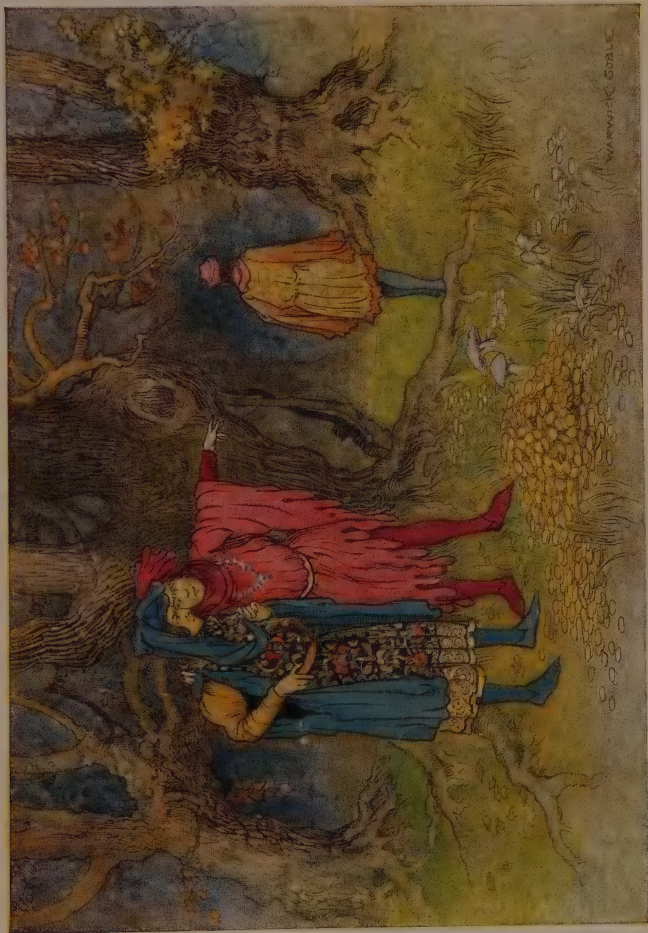
THE THREE REVELLERS AND THE GOLD